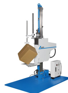
Setting condition of package